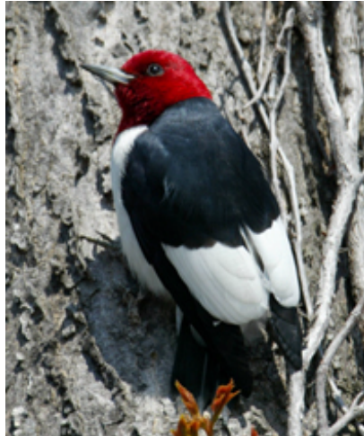
Red headed woodpecker

Woodpeckers belong to the order Piciformes and the family Picidae, which also includes flickers and sapsuckers. Twenty one species inhabit the United States. Woodpeckers have short legs with two sharp clawed, backward pointed toes and stiff tail feathers, which serve as a supportive prop. These physical traits enable them to cling easily to the trunks and branches of trees, wood siding, or utility poles