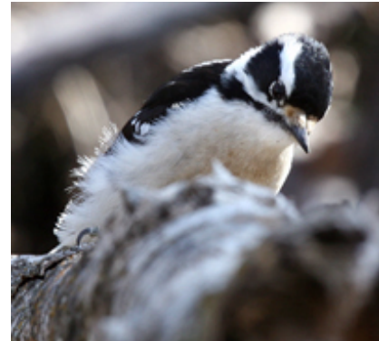
Downy woodpecker

while pecking. They have stout, sharply pointed beaks for pecking into wood and a specially developed long tongue that can be extended a considerable distance. The tongue is used to dislodge larvae or ants from their burrows in wood or bark.