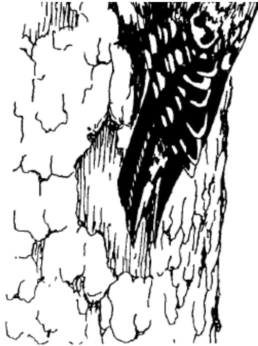
Fig. 2. Yellow bellied sapsucker, Sphyrapicus varius

In recent times, controls against wood peckers to protect commercial crops have only rarely been necessary. Published accounts suggest that these isolated instances occurred mostly in the fruit growing states of the far West where the Lewis' woodpecker ( Melanerpes lewis ), whose flocks may number several hundred, is most often implicated.